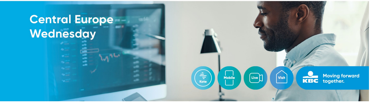
Wednesday, 13 December 2023